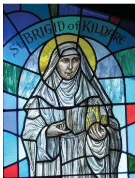
St Brigid of Ireland